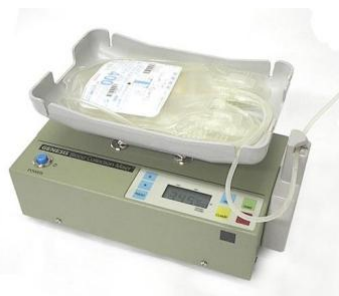
Clamp module can be mounted at the left or at the right.