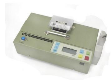
Tray removed to be stowed in the canvas carrying bag.