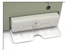
Replaceable battery pack